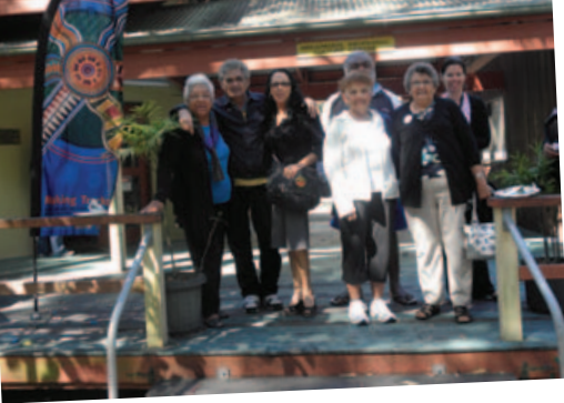
The elders who attended the day.