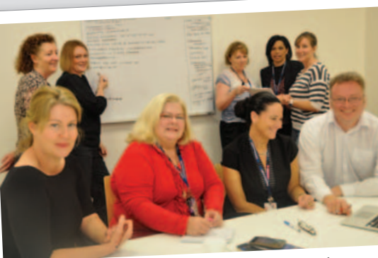
Members of the Access and Patient Flow Unit at work

Under the guidance of doctors, nurses and allied health staff the medical students assessed eight areas including bed safety, medication safety, infection control, correct patient identification, malnutrition, fall prevention, recognition and management of deteriorating patients and pressure injuries.