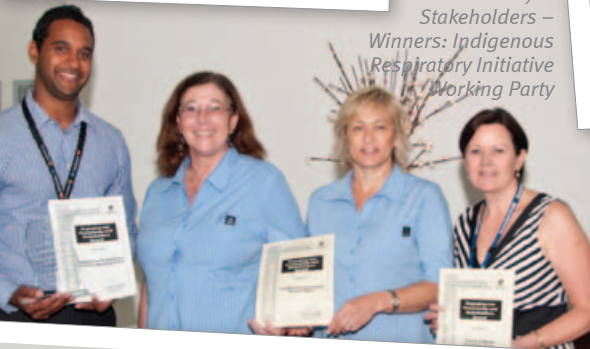
Engaging our Community & Stakeholders – Winners: Indigenous Respiratory Initiative Working Party