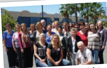
Volunteers and participants together at the first workshop in September

Seven health professionals have also taken advantage of the program to gain their certificate of competence to become Accredited Flinders CCSM Trainers themselves.