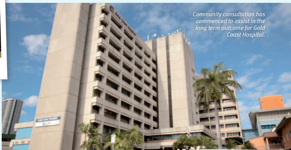
Community consultation has commenced to assist in the long term outcome for Gold Coast Hospital.