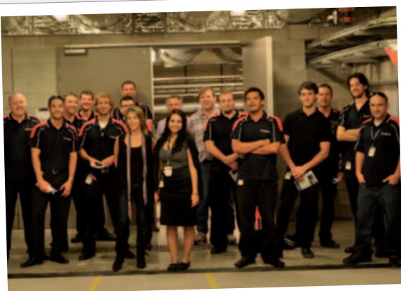
Gold Coast Information Division team on tour in the Basement of the Central Energy Plant.

The 'open house' tour was a once only opportunity for staff to view the extensive multi-million dollar equipment that will be essential to the operation of the new hospital and surrounding precinct following the move in 2013.