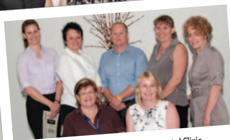
Access and Flow – Winners: Antenatal Clinic, Maternity Home Visiting Team & Child Health Services