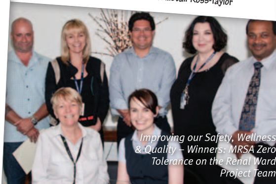
Improving our Safety, Wellness & Quality – Winners: MRSA Zero Tolerance on the Renal Ward Project Team