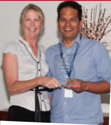
Wise use of our Resources – Winners: Northside ATODS