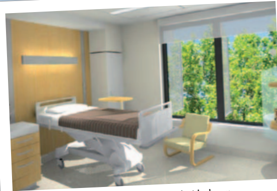
Concept image of standard patient bedroom

"With over 8000 rooms at our new hospital, early room reviewing is our best chance to get the best possible outcome for both the builders, and those that will be using the spaces in years to come."