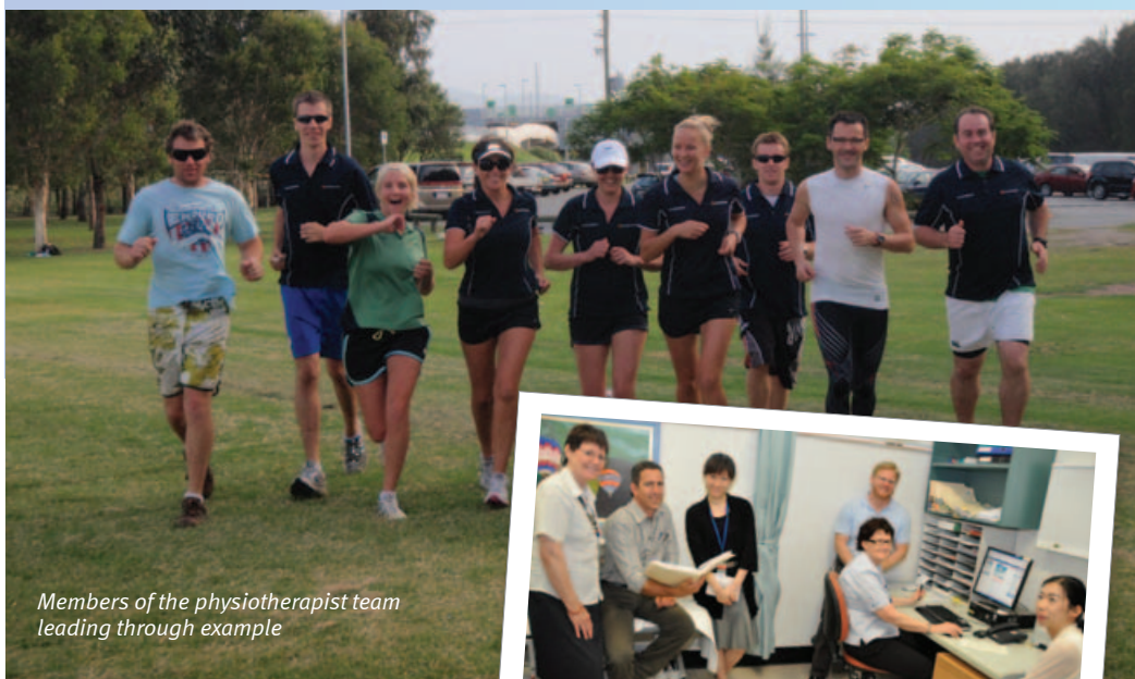
Members of the physiotherapist team leading through example

If you are interested in ideas to improve health and fitness in your area contact the physiotherapy department - PH: 5591 8460