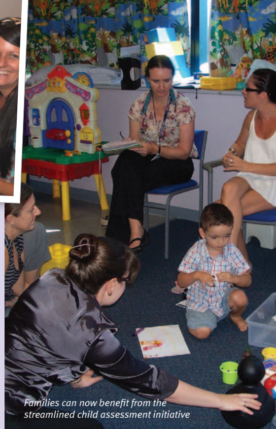
Families can now benefit from the streamlined child assessment initiative

"I look forward to receiving them as the information is so useful. For example, what to eat while I was breast feeding and when to start my baby on solid food," she said.