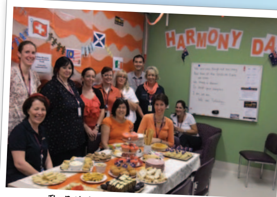
The Pathology Department at Robina Hospital gets into the spirit of Harmony Day.

The Mental Health Rehab Team, with support from clients, won the morning tea competition by celebrating with artwork, live music and multicultural dishes.