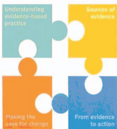
From evidence to action - this year's theme for International Nurses Day

For more information visit: http://qheps.health.qld.gov.au/goldcoast_nursing/html/ind-2012.htm