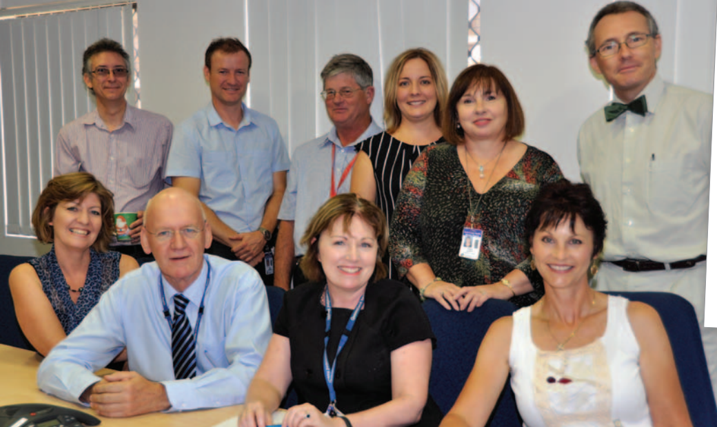
Above: CURB is using data to encourage changes to clinical practice.