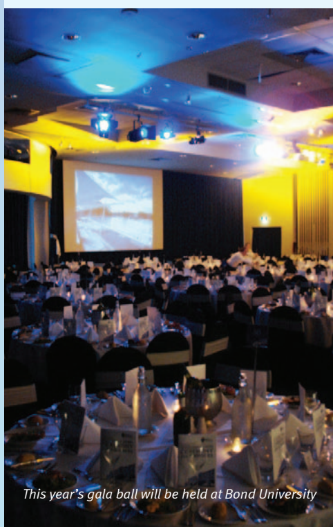
This year's gala ball will be held at Bond University

In the new financial year the Foundation is investigating a new type of art union and opportunities for wider community involvement.