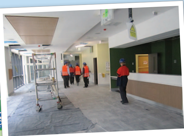
Cancer Services visiting their new work home

Above: The Queensland Health 5.7km Challenger route will take in greater Broadwater views this year.