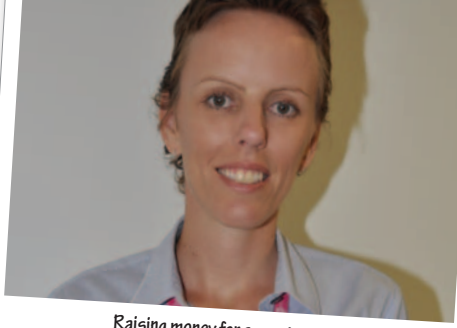
Raising money for a great cause