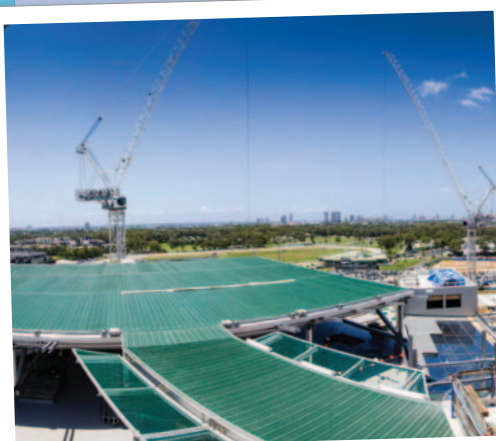
View from the new helicopter landing site at GCUH, where trauma patients will be received.

If your service area would like to expand its consumer and community engagement activities contact Tony Matheson, Community Engagement Officer for the district.