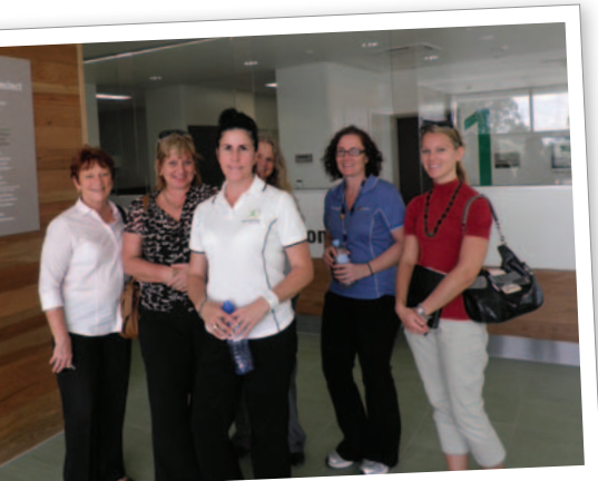
Community Rehabilitation team members check out their new digs

Robina Health Precinct is now open. The new facility offers a range of services including child, youth and family clinics, allied health outpatients and cardiac rehabilitation.