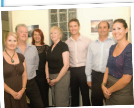
Transition Team members.

The Transition Managers look forward to introducing themselves to departments in coming months.