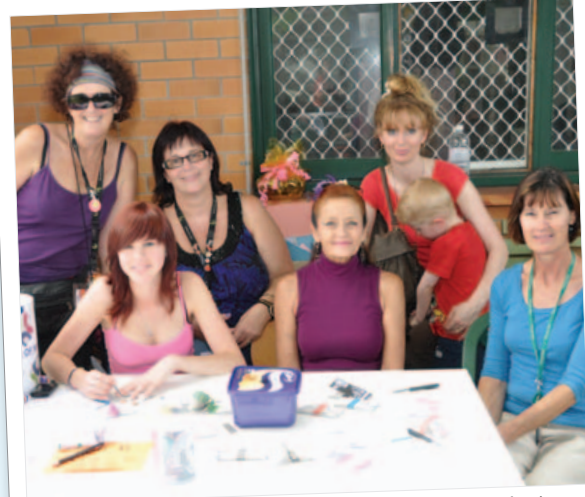
A staff BBQ was held to fund raise for a fellow staff member in their time of need, these actions reflect the values and spirit the district seeks to embrace in its employees.

At the debrief there was positive feedback about how staff managed under pressure and although it was a simulation, the exercise contributes to the District's ability to manage a real life situation.