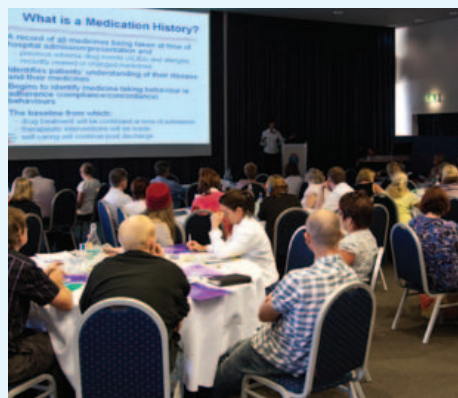
Nurse Practitioners from across the state took part in the conference held at Bond University

For more information about Nurse Practitioners please visit www.health.qld.gov.au/ocno/nurseprac/about.asp or www.acnp.org.au/