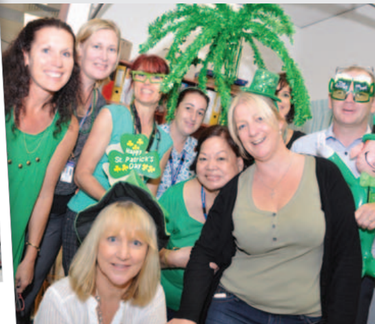
The staff in HODU embraced their inner Leprechaun by dressing up for St Patrick's Day.