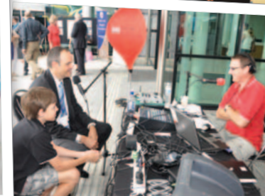
Gold Coast ABC Radio's live broadcast.