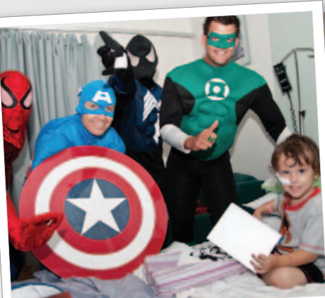
Local volunteers took time out of their day to take part in 'Hero's on the Run', a superhero costume charity run to raise money for the Children's ward.

She returned to Australia in 1985 and has been working for Community Health since 1991.