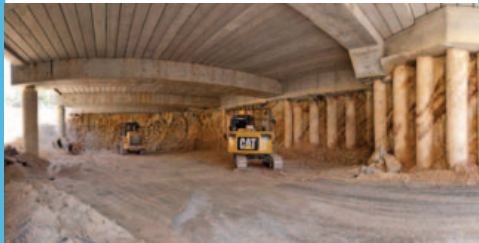
Latest photos of the GCRT Tunnel